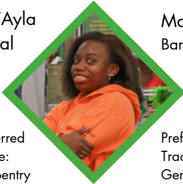
Preferred Trade: Carpentry