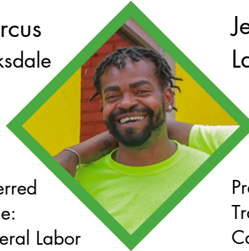
Preferred Trade: General Labor