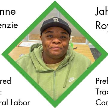
Preferred Trade: General Labor