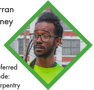
Preferred Trade: Carpentry