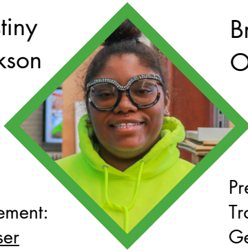
Job Placement: Messer