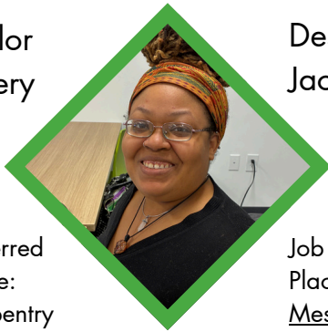
Preferred Trade: Carpentry