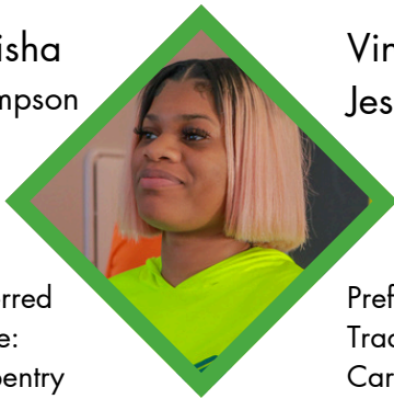
Preferred Trade: Carpentry