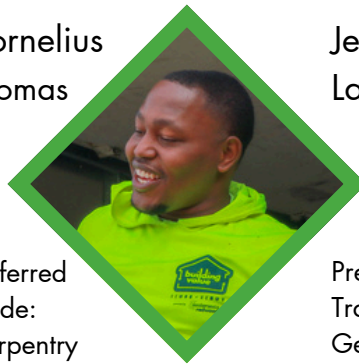
Preferred Trade: Carpentry