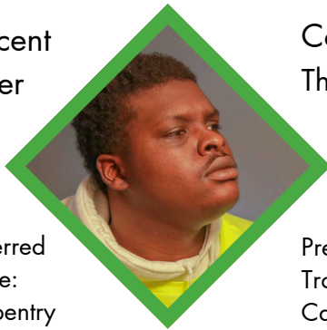
Preferred Trade: Carpentry