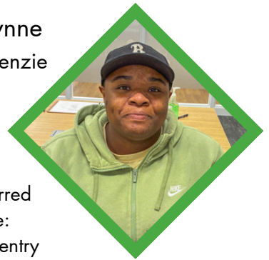
Preferred Trade: Carpentry