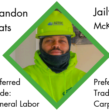
Preferred Trade: General Labor